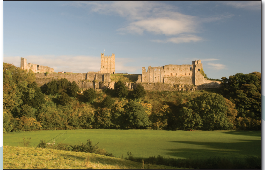
Panoramic view showing Richmond Castle in its entirety from Sleegill.