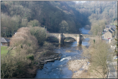
Left: Green Bridge spanning the River Swale.