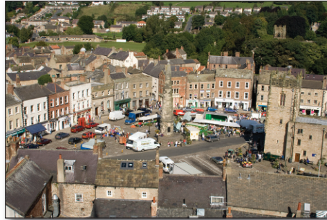
Top left: Cornforth Hill terraces bathing in late summer sunshine.