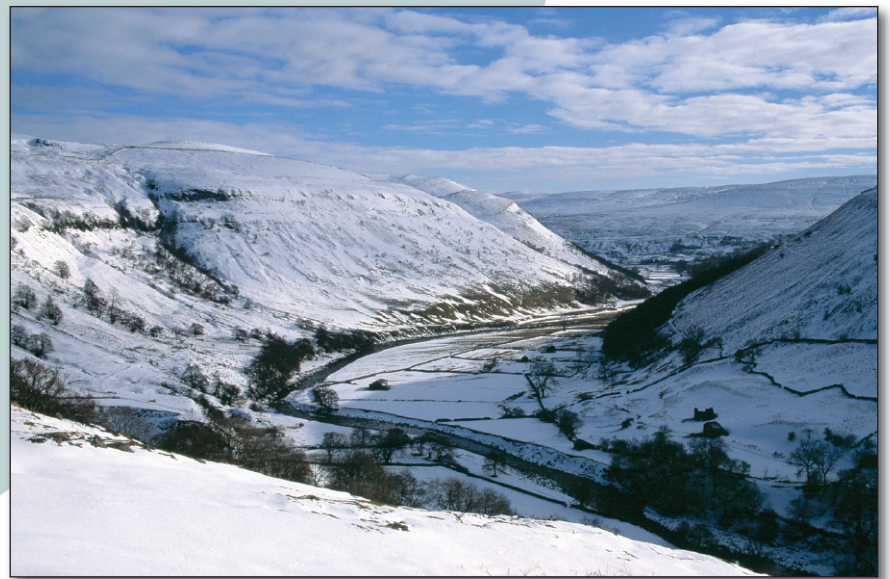
A winter view from Keld, looking back towards Muker in Swaledale.